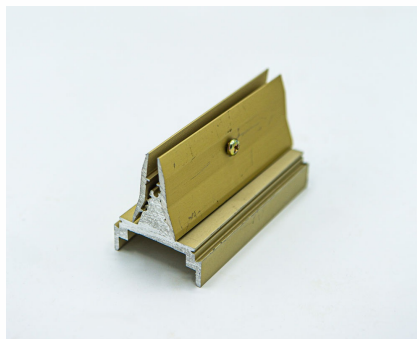
Fimor Serilor® MACH Straight Squeegee Holder