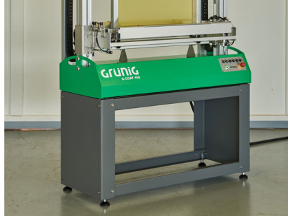
Optional easy-mount floor stand (Option U)