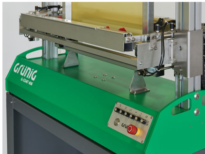
Lower portion of unit on easy-mount stand