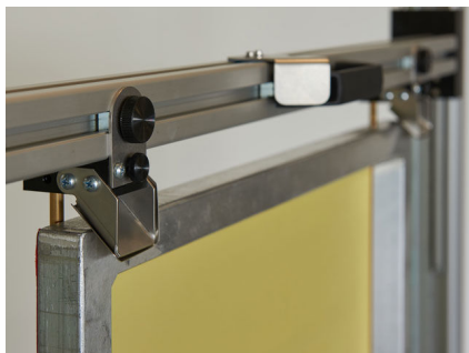
Upper screen holder