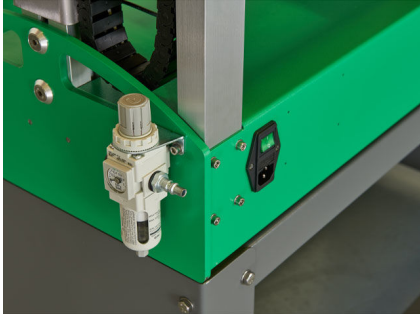
Power and pneumatic connections