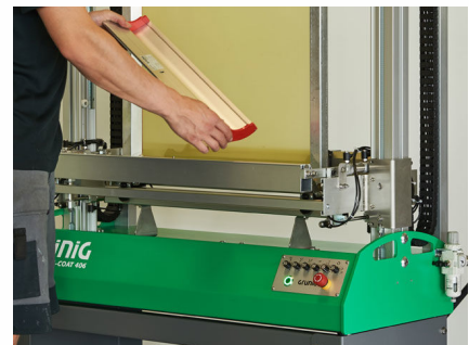
Installation of coating trough