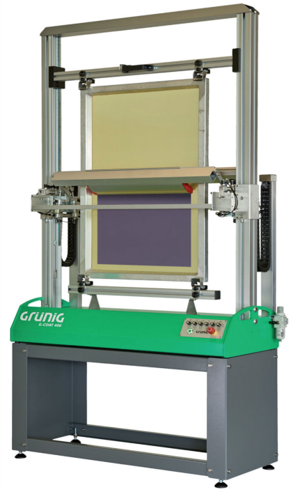
Optional easy-mount floor stand (Option U)