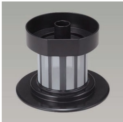
Vacuum Cleaner Filter