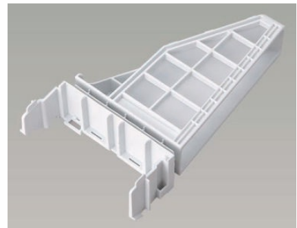
Washer / Dryer Filter